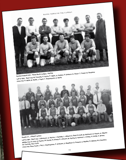
Roade Football Club - 1904

The comprehensive index contains over 450 surnames of people appearing in the photographs or mentioned in the text.